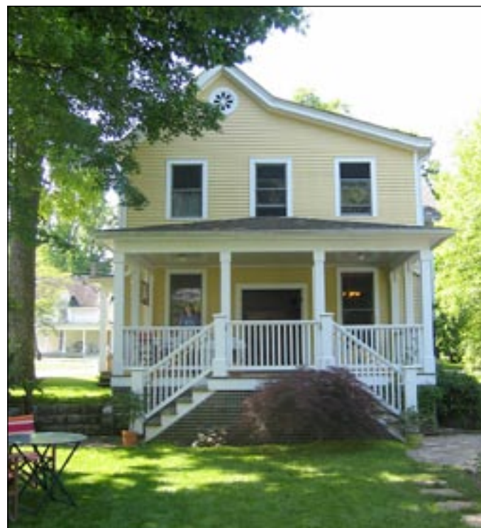
View of home from back yard and garden