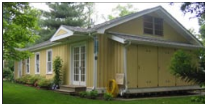
Back of garage/workshop - office features French doors

This beautiful home is located on an established street with mature trees two blocks from downtown Versailles, in the heart of the Bluegrass horse country. Only 20 minutes to Lexington, an hour to Louisville, and 1-1/2 hours to Cincinnati.